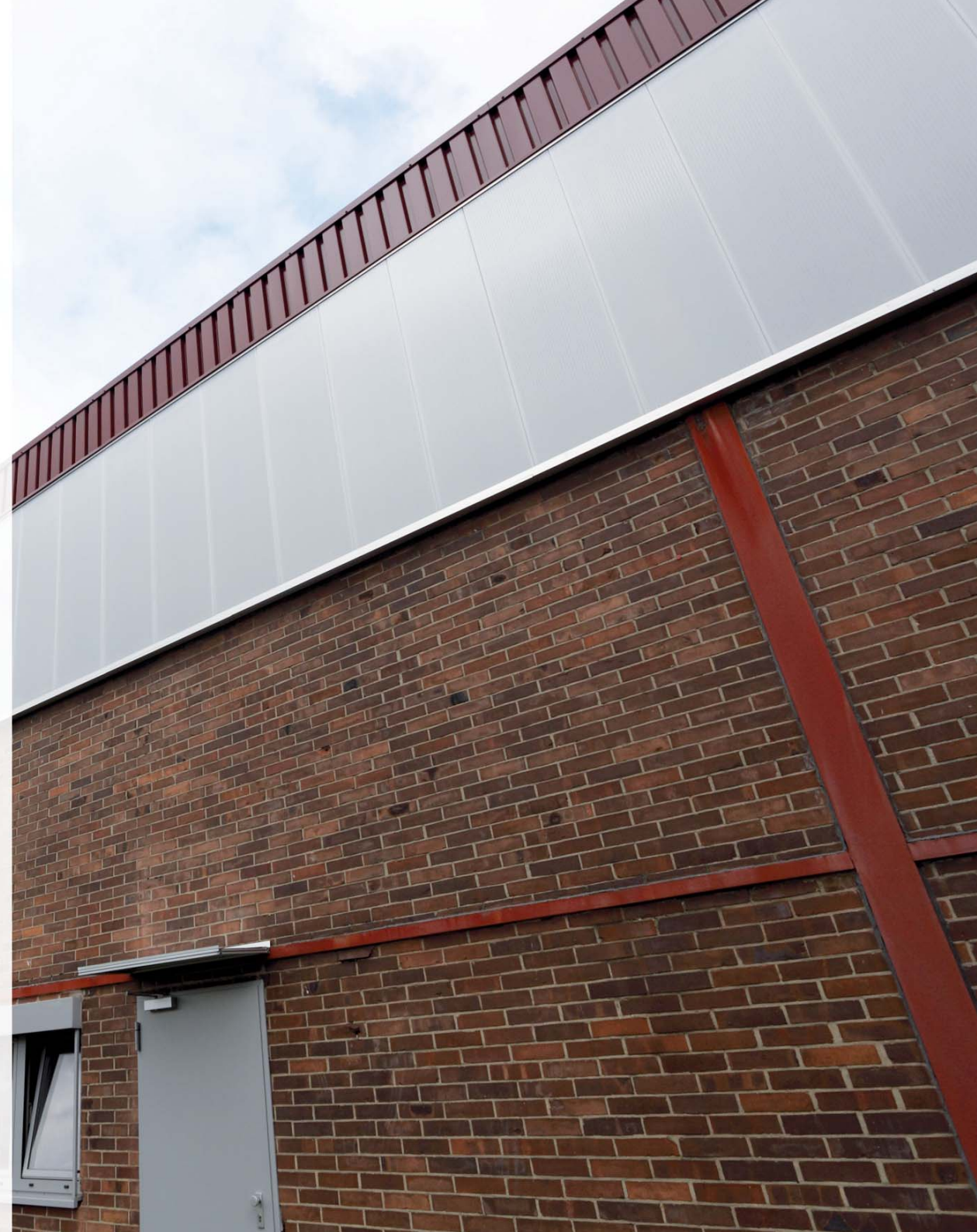
Illustration: Volkswagen Group also banks on the advantages of Lumira aerogel.

The respective U-values relate to vertical installation positions. When installed horizontally the U-value worsens in general. The U-value for Lumira® aerogel filled polycarbonate multi-wall panels has been taken from horizontally installed elements, i.e. in the most unfavourable installation position.