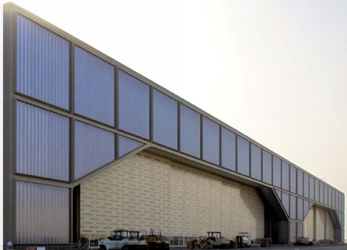
Illustration: Apart from a brilliant light transmission the most important benefit for this airplane hangar is the reduced solar transmission, as it is located in Qatar.