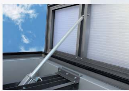
Traverse mounted directly on a plinth