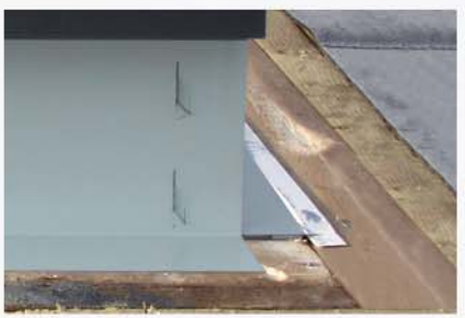
Plug-in plinth before gluing-in