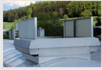
MEGAPHOENIX on a skylight