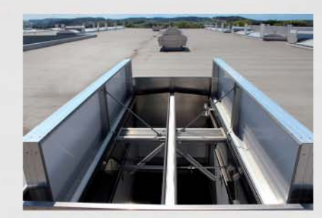
The inside of a MEGAPHOENIX