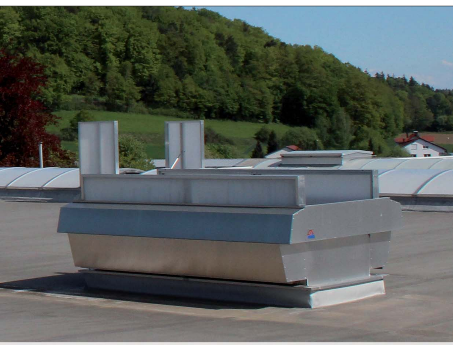
Large illustration: MEGAPHOENIX as a stand-alone unit on a factory building.